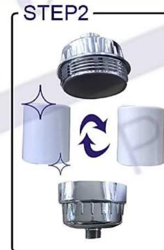
EXCHANGE NEW CARTRIDGE