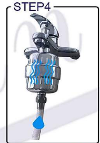
FLUSH NEW FILTER FOR 20-30 SECONDS