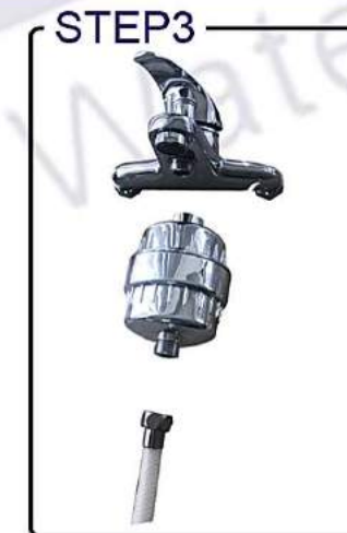
RESSEMBLE THE SHOWER FILTER