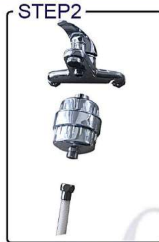
ASSEMBLE THE SHOWER FILTER