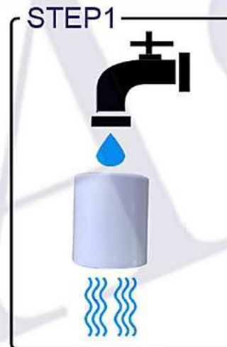
FLUSH NEW CARTRIDGE FOR 20-30 SECONDS BEFORE USING